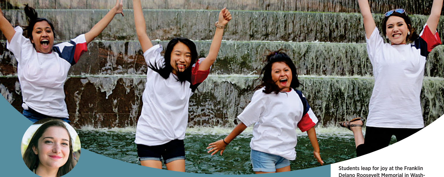
Students leap for joy at the Franklin Delano Roosevelt Memorial in Washington, D.C., above, and explore the Texas Capitol, below, in 2016.

“It 100 percent is the trip of a lifetime that I am not going to forget.”