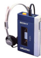
1979 Sony releases Walkman