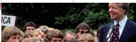
1976 Texas sends one bus with 38 people on Youth Tour