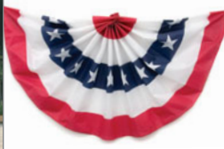
1976 Youth Consulting Board formed (now Youth Leadership Council)