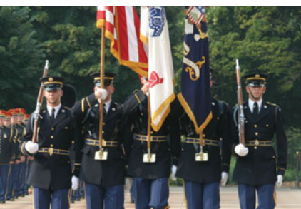
1976 U.S. bicentennial